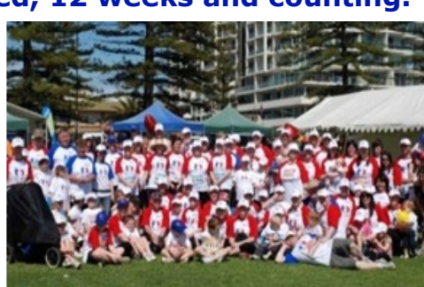
2009 HeartKids city-Bay Team Photo at the finish.

This year we are very appreciative to some local personalities who have chosen to get "on their marks for little hearts" by being involved in the